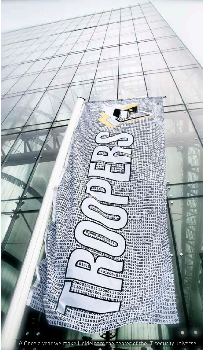
// Once a year we make Heidelberg the center of the IT security universe.