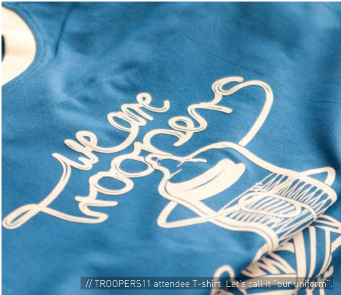
// TROOPERS11 attendee T-shirt. Let's call it "our uniform".